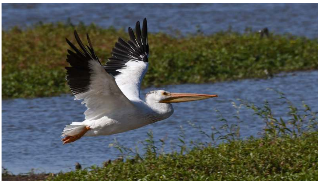
Figure 4: White Pelican. Goose Pond, Indiana Division of Fish & Wildlife