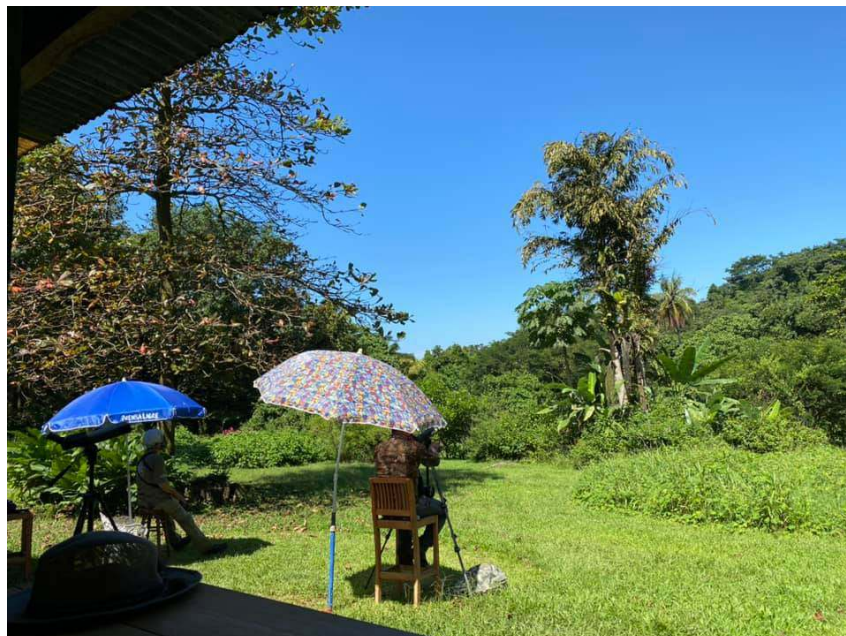
Figure 6: A Big Sit! Circle in Guatemala