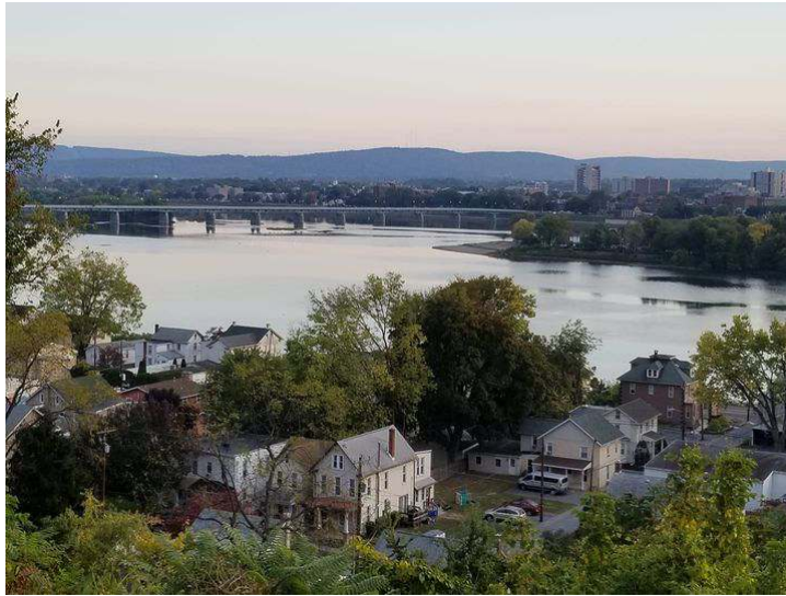
Figure 2: High Point on the Susquehanna