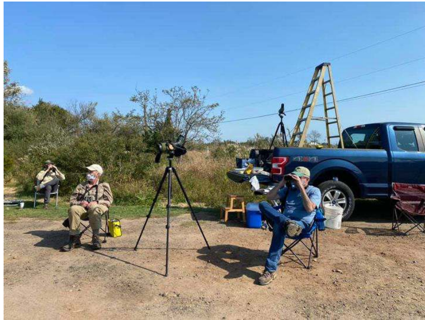
Figure 5: A high point established on Long Island Sound, CT.