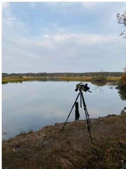
Figure 1: Salt Meadow, Stewart B McKinney NWR, Connecticut

This year The Big Sit! had three countries participating: Costa Rica (one circle, 47 species), Guatemala (three circles, 147 species), and the United States of America (98 circles, 358 Species). Hopefully in the future we can attract Big Sit! circles in other countries and on other continents.