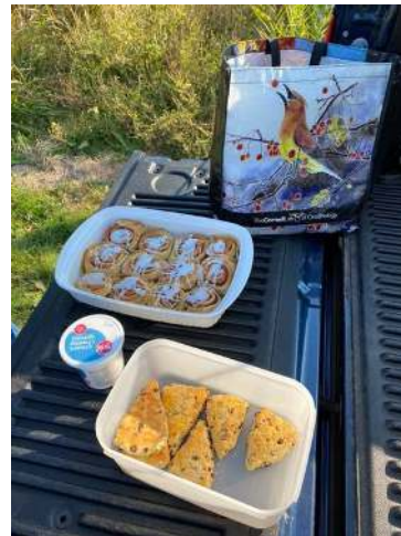
Figure 3: Big Sit! Snacks